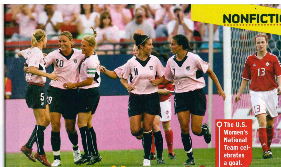
The U.S. Women's National Team celebrates a goal.