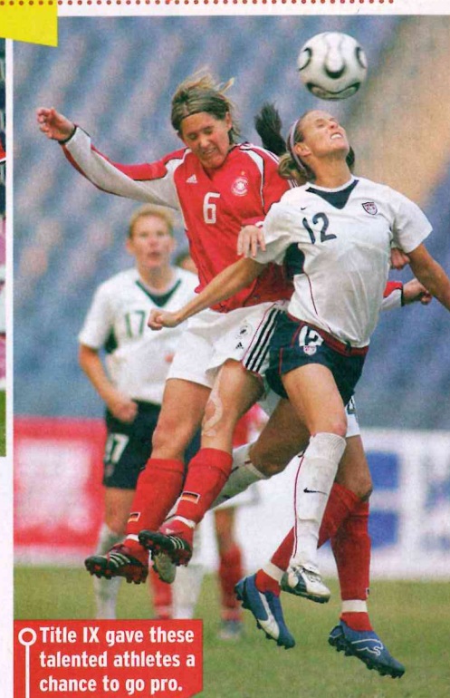
Title IX gave these talented athletes a chance to go pro.